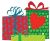
Gifts from the Heart Christmas Shop